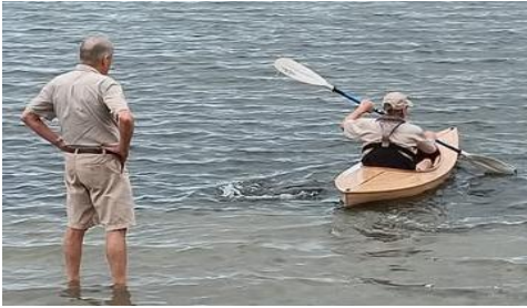
First paddle of the upstairs Canoe