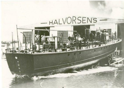
ML 819 was one of eleven Fairmile motor launches built by Halvorsens

During the second World War the Halvorsen boatyard, then operating five slipways at Ryde on the Parramatta River, built over 250 vessels for the American and Australian military forces, including tenders and barges plus the fast 38 foot air-sea rescue boats, the 62 foot supply boats and the famous 112 foot Fairmile rescue boats.